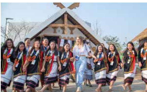
Delegates enjoy the traditional folk dance of Manipur