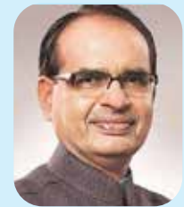
Shivraj Singh Chouhan Chief Minister of Madhya Pradesh

“There can be an alternative for everything in this world, but grain, fruits and vegetables have no alternative”