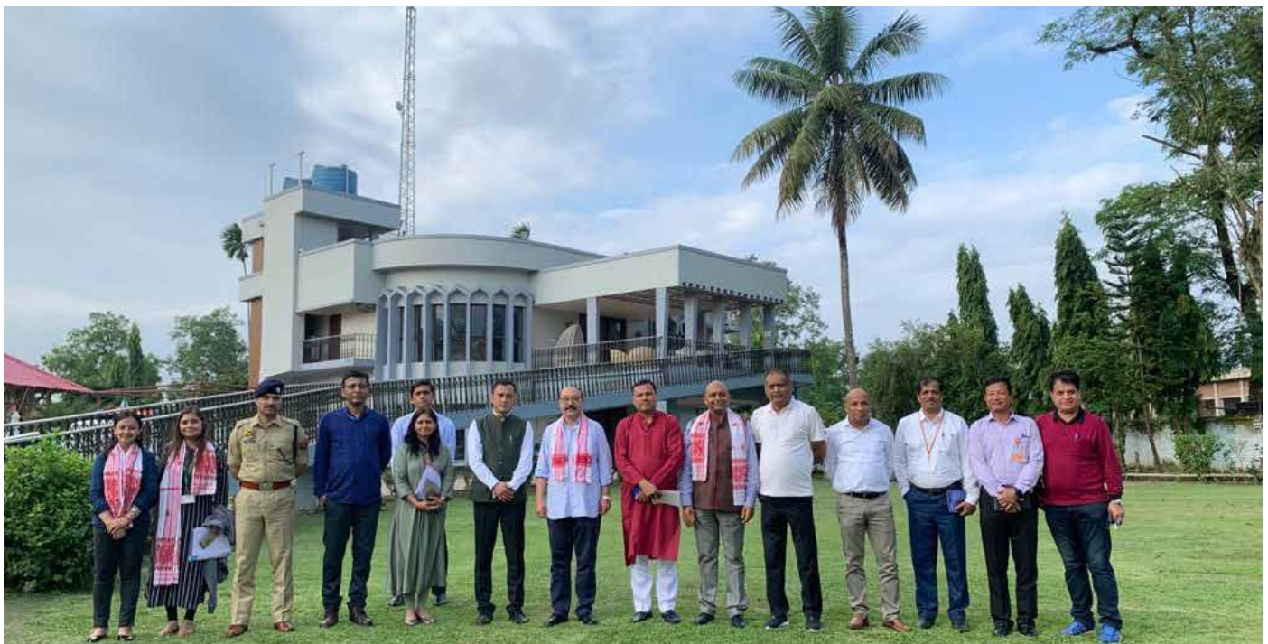
Team from the G20 Secretariat visits Assam to review the preparations for G20 meetings