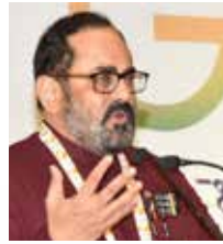
Ashwini Vaishnaw Union Minister for Electronics & Information Technology

“Technology allows benefits, subsidies, government programmes to reach Indian citizens without any leakage, without any intermediation, without any delay, and with absolute clarity”