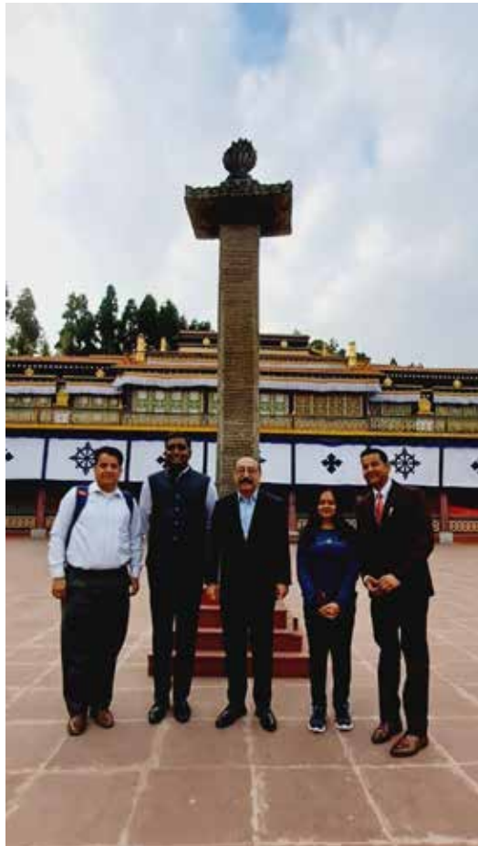
Team from G20 Secretariat at the Rumtek Monastery in Sikkim

In Assam, Nagaland, Sikkim and Mizoram, the condition of airports was assessed resulting in fast-tracking of various works at the airports in Dibrugarh, Dimapur, Imphal, Bagdogra and Aizawl in the run up to G20 meetings at those locations. After visiting Mizoram, capacity upgrades of Mizoram State University were also proactively undertaken with the support of the Union