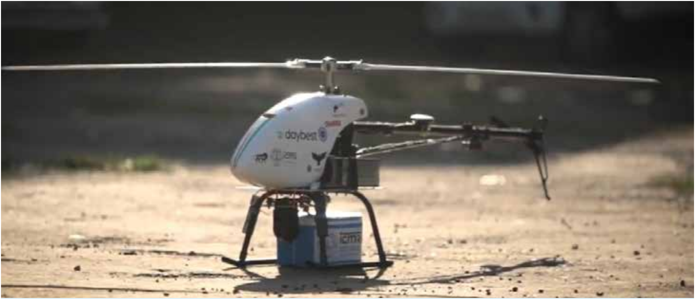
i-Drone initiative: Last mile delivery of vaccine through drones

the vaccine was the aim of preventing deaths and severe sickness in people. The demonstrated efficacy of the vaccine has been highlighted in more than nine international scientific journals. COVAXIN has been the backbone of India's national COVID-19 vaccination drive, which went on to become one of the largest vaccination drives in the world. Over 350 million doses of COVAXIN have been administered in India. In addition to this, it has also received emergency use authorization in 14 countries including Mexico, Brazil and Nepal, among others. The indigenous production of the vaccine has enabled India to supply 14.8 million doses to over 100