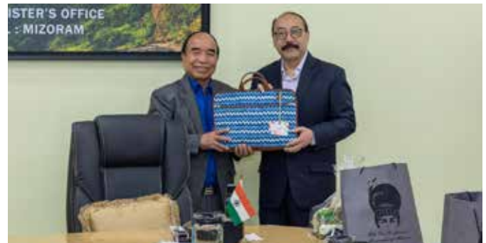
On January 28, 2023, Chief Coordinator Harsh Vardhan Shringla discussed opportunities for Mizoram during upcoming G20 India events with Chief Minister Shri Zoramthanga

This is made possible by ensuring close coordination with all stakeholders, particularly our states. Since the North East region of India is unique and distinct in its own way, there are various factors that have to be taken into consideration while organising G20 meetings there. It was with this in mind that I visited six of the