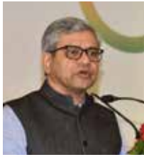
Yogi Adityanath Chief Minister, Uttar Pradesh

“UPI has reached a scale where on an annual basis $1.5 trillion worth transactions are done and the average settlement time is 2 seconds”