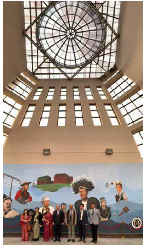
Team from G20 Secretariat at the Legislative Assembly, Itanagar, Arunachal Pradesh

Ministry of Education. A comprehensive inspection of medical facilities of G20 meeting venues was carried out in order to ensure adequate facilities for delegates, another non-negotiable factor for the G20 Secretariat. To facilitate the travel of G20 delegates, a simplified and convenient visa and entry policy has been formulated.