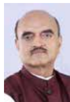
Amitabh Kant G20 Sherpa, India

“Women have always played a crucial role from Indian mythology to the freedom struggle, be it goddess Parvati or Jhansi ki Rani”