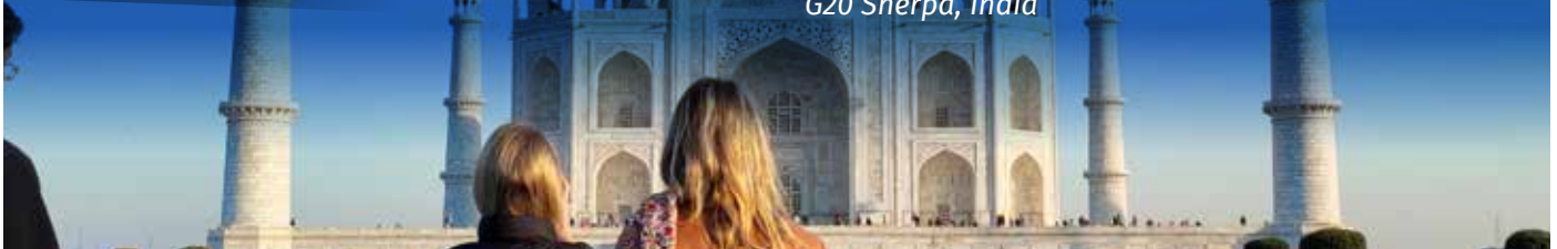
Amitabh Kant G20 Sherpa, India

“India’s G20 Presidency will be inclusive, decisive, outcome-oriented, action-oriented and nobody can achieve this more than women of the world”