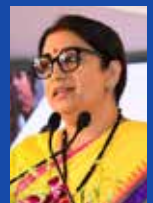
Smriti Zubin Irani Union Minister for Women & Child Development

“If you want to get your future right, if you want to be future-ready, make sure that women are at the centre of the discourse”