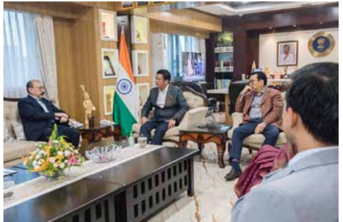
G20 Chief Coordinator meets Chief Minister of Arunachal Pradesh Shri Pema Khandu