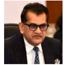
Dr. Mahendra Nath Pandey Union Minister for Heavy Industries

“We should use the G20 to spread the digital public infrastructure to other parts of the world”