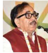
Rajeev Chandrasekhar Union Minister of State for Electronics & Technology

“Digital technology has been the bedrock of economic transformation in G20 countries”