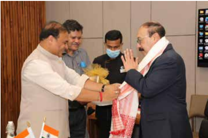
G20 Chief Coordinator Harsh Vardhan Shringla welcomed by Chief Minister of Assam Shri Himanta Biswa Sarma