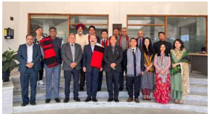
G20 Chief Coordinator and his team meet Chief Minister of Nagaland Shri Neiphiu Rio

meeting Youth20 Inception in Guwahati - saw energetic participation of young people of different nationalities. A special treat for G20 delegates was a visit arranged by the Government of Assam to the Kaziranga National Park, a UNESCO World Heritage site.