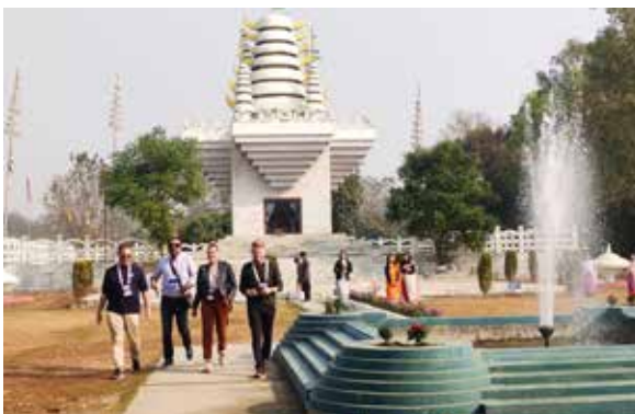
Delegates visited the historic Kangla Fort