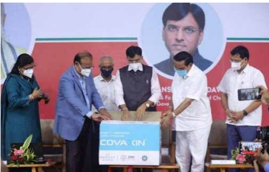
Hon'ble Union Minister of Health and Family Welfare, Dr. Mansukh Mandaviya launching the first commercial batch of COVAXIN

project. The initiative was piloted in the state of Manipur to guarantee prompt, secure, and last-mile delivery of the vaccines. Before this project, South-East Asia had never witnessed the delivery of vaccines through Unmanned Aerial Vehicles (UAV). India's success in indigenously developing a safe and effective COVID-19 vaccine, in record time, is a testament to its bio-medical advancement. As we learn from the experience of tackling COVID-19, the remarkable story of the COVAXIN development serves as a model for how we can prepare for future health challenges while building a healthier and safer world for all. ■