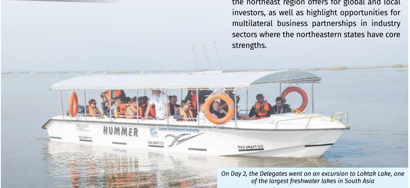
On Day 2, the Delegates went on an excursion to Loktak Lake, one of the largest freshwater lakes in South Asia

The first of the four B20 conferences scheduled in North East states of India, was held in Imphal, Manipur from February 17-19, 2023. The three-day meeting discussed 'Opportunities for Multilateral Business Partnership in ICT, Medical Tourism, Healthcare and Handlooms' in which over 100 delegates from 23 countries participated. The event aimed to showcase the potential that the northeast region offers for global and local investors, as well as highlight opportunities for multilateral business partnerships in industry sectors where the northeastern states have core strengths.