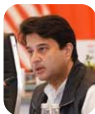
Jyotiraditya M. Scindia Union Minister for Civil Aviation & Steel

“We need to adopt a 3S strategy for agricultural ecosystem, one that is smart, sustainable, and serves everyone”