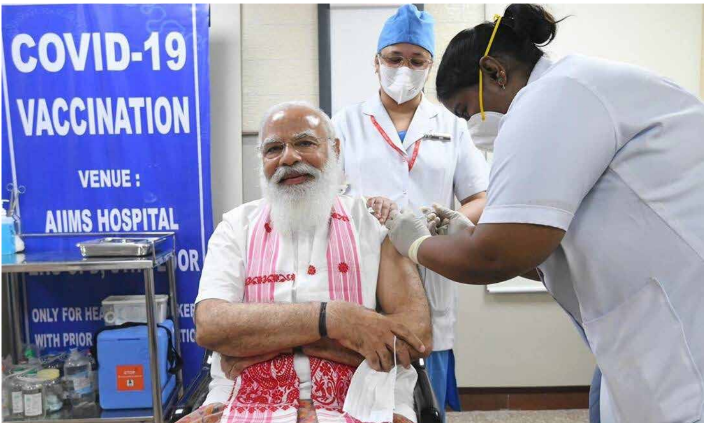
Hon'ble Prime Minister of India, Shri Narendra Modi being administered the vaccine (COVAXIN)

COVAXIN: Indigenously Developed Vaccine for Covid-19